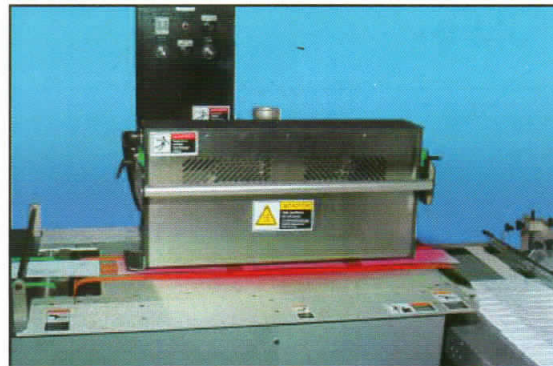
Specially designed bulbs reduce glare and direct most infrared energy towards the ink pattern. This means lower power settings can be used, reducing energy consumption and extending bulb life.